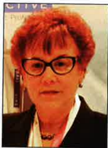
Dr. Cheryl Effron

Night is the perfect time to use this cream as the skin is able to absorb the active ingredients better than during the day. According to American dermatologist Dr. Cheryl Effron, this is the only product backed by scientific research that has sophisticated synergy to achieve results using ingredients like maltobionic acid, Chardonnay grape seed extract, apple stem cell extract, peptides and glycolic acid. "Maltobionic acid, which has 30 times water holding capacity, not only increases production of collagen, it reduces destruction of collagen," reveals Dr. Effron. "The grape seed extract has almost 40 percent greater ability to absorb free radicals than vitamin C while the apple stem cell extract protects and extends the life of the skin's own stem cells. Each ingredient is amazing by itself, but when they're combined, they outperform any other molecules."